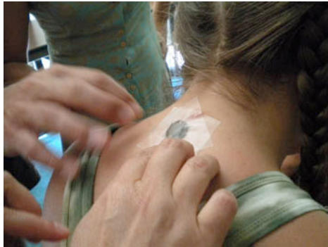
A Treatment of Herbal Moxibustion for lung disorders